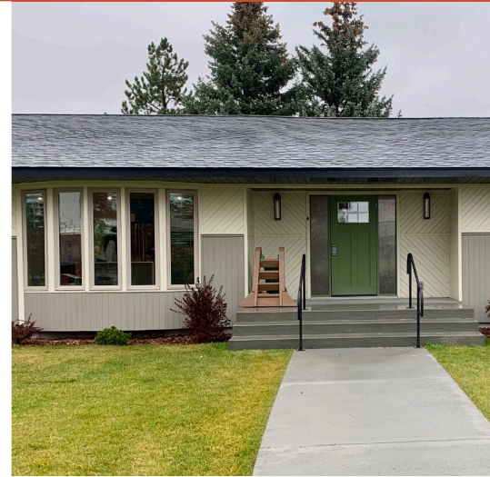
Gambal House — This generously donated home was moved to Main Street in Driggs to address the local childcare crisis.